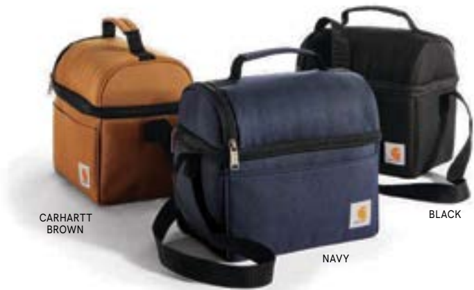
CARHARTT® LUNCH 6-CAN COOLER CT89251601