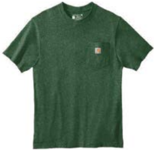
CARHARTT® Workwear Pocket Short Sleeve T-Shirt CTK87 | Adult Sizes S—4XL | 11 Colors