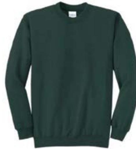
PORT & COMPANY® Core Fleece Crewneck Sweatshirt PC78 | Adult Sizes: S—4XL | 25 Colors