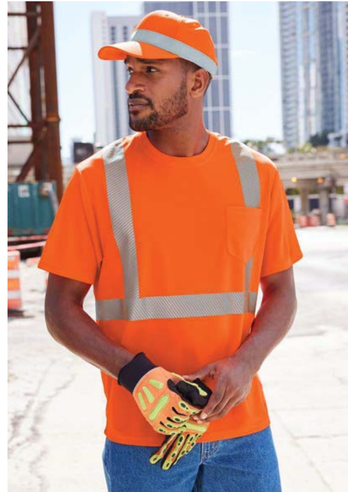
CORNERSTONE® ANSI 107 Class 2 Segmented Tape Tee CS204 | Adult Sizes: S—5XL | 2 Colors