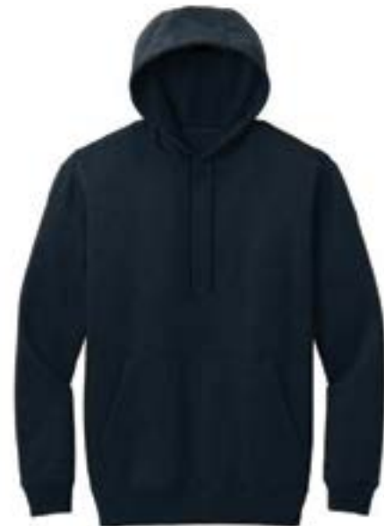
CORNERSTONE® Tough Fleece Pullover Hoodie CSF630 | Adult Sizes: XS—6XL | 5 Colors