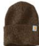
DARK BROWN/ SANDSTONE