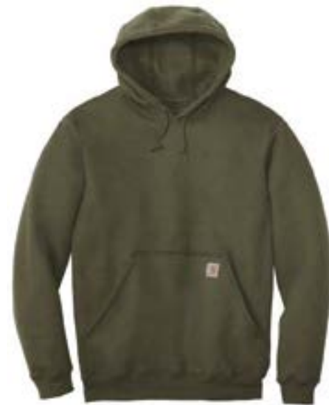
CARHARTT® Midweight Hooded Sweatshirt CTK121 | Adult Sizes: S—4XL | 7 Colors