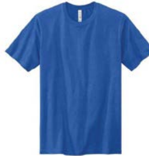
VOLUNTEER KNITWEAR™ All-American Tee VL100 | Adult Sizes: S—4XL | 11 Colors