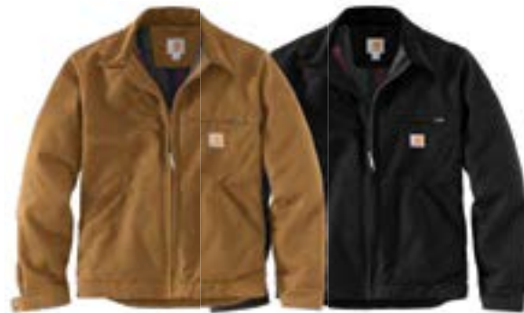
CARHARTT BROWN BLACK