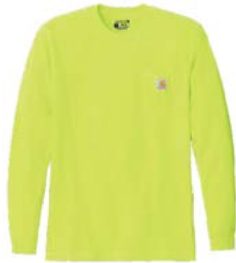
CARHARTT® Workwear Pocket Long Sleeve T-Shirt CTK126 | Adult Sizes: S—4XL | 6 Colors