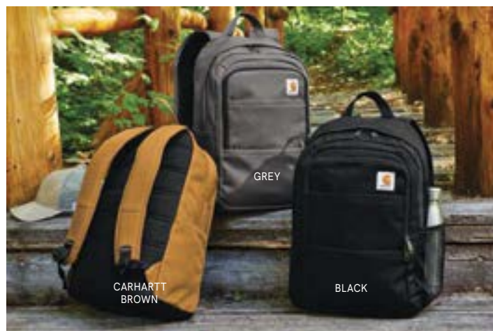
CARHARTT® FOUNDRY SERIES BACKPACK CT89350303