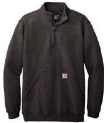
CARHARTT® Midweight 1/4-Zip Mock Neck Sweatshirt CT105294 | Adult Sizes: S—4XL | 4 Colors