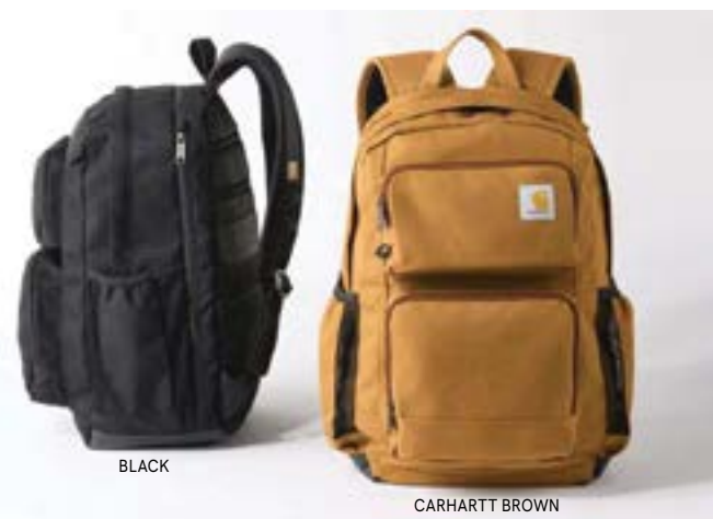
CARHARTT® 28L FOUNDRY SERIES DUAL-COMPARTMENT BACKPACK CTB0000486