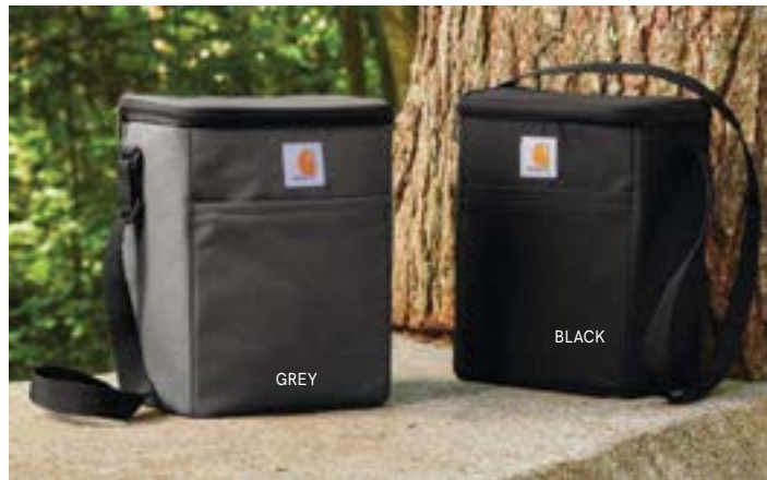
CARHARTT® VERTICAL 12-CAN COOLER CT89032822