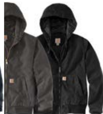
GRAVEL (CT104050 ONLY)