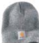
HEATHER GREY/ COAL HEATHER