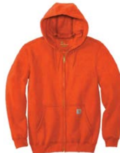
CARHARTT® Midweight Hooded Zip-Front Sweatshirt CTK122 | Adult Sizes: S—4XL | 7 Colors