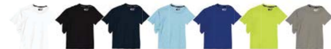
WHITE BLACK NAVY FRESH WATER BLUE ROYAL GLASS BLUE BRITE LIME ASPHALT GREY