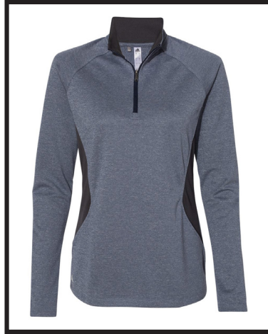
ADIDAS - WOMEN'S PULLOVER - A281