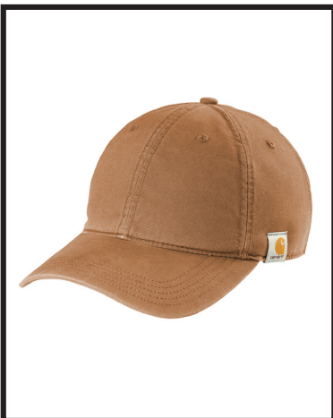
CARHARTT - CT103938