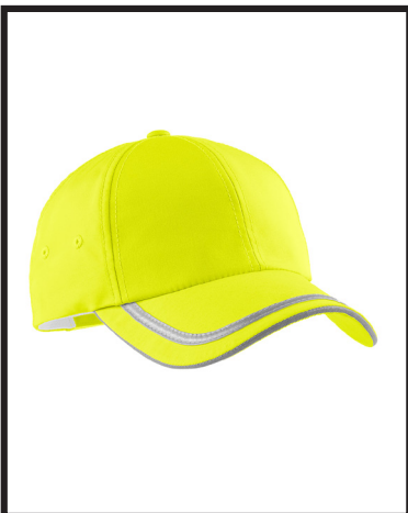
PORT AUTHORITY - C836