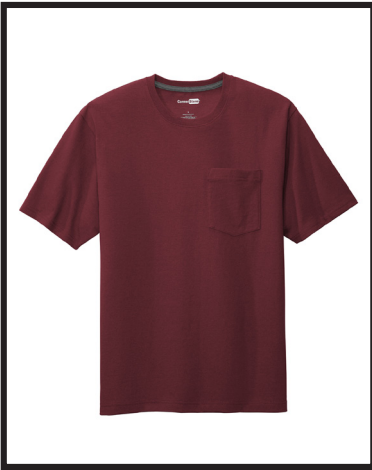
CORNERSTONE - CS430