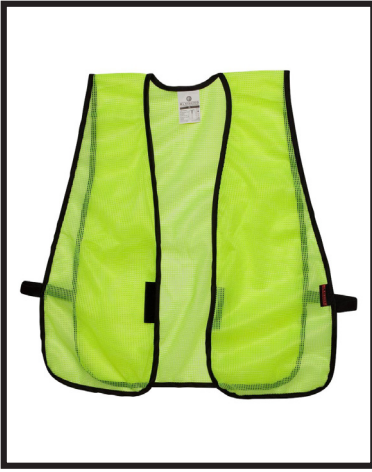
KISHIGO - P-SERIES MESH VEST - PL-V17-V18