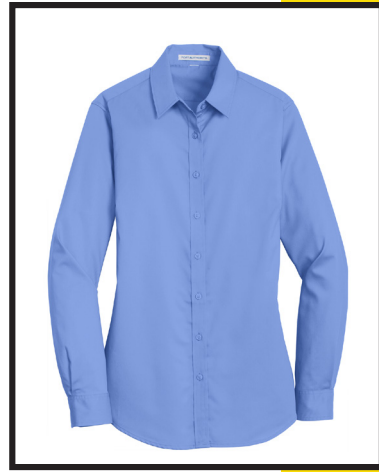
PORT AUTHORITY LADIES SUPERPRO - L663