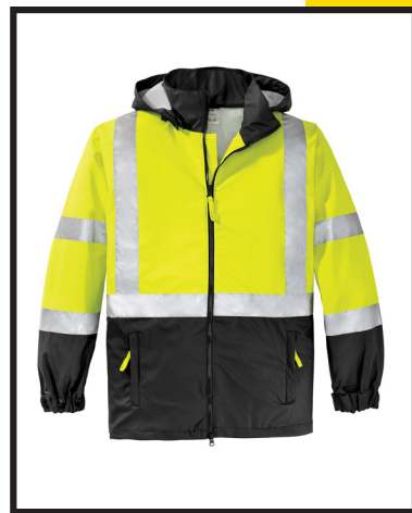
CORNERSTONE - CSJ25