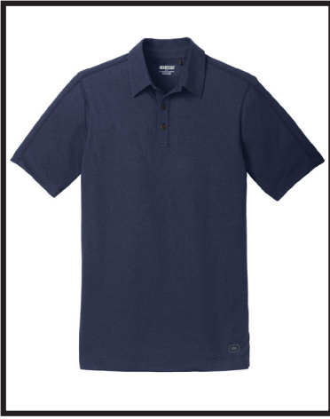
OGIO - 0G126