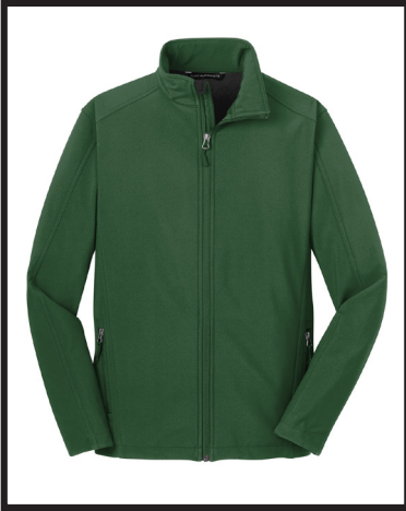
PORT AUTHORITY - J317