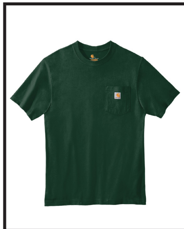
CARHARTT - CTK87