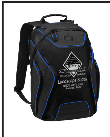
OGIO - HATCH PACK - 91001