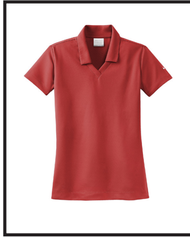
NIKE LADIES - 354067