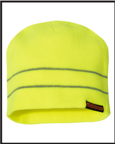
KISHIGO - BEANIE - 2826-2827