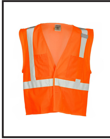
KISHIGO - 4 POCKET HOOK AND LOOP MESH VEST - 1083-1084