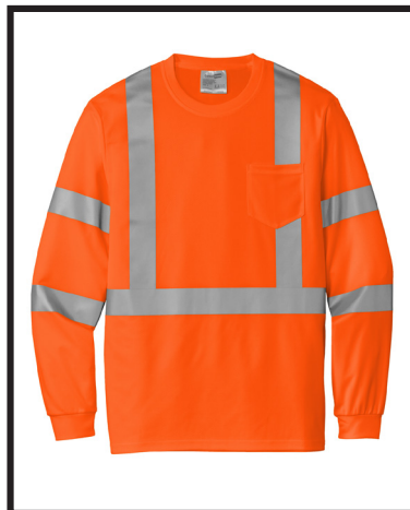
CORNERSTONE - CS203