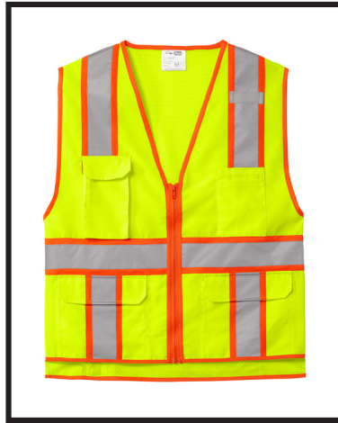
CORNERSTONE - CSV105