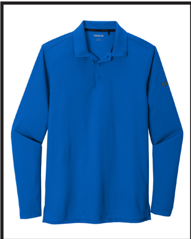
OGIO - 0G105