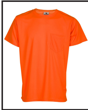
T-SHIRT - 9124-9125