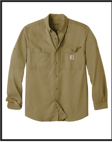
CARHARTT FORCE - CT102418