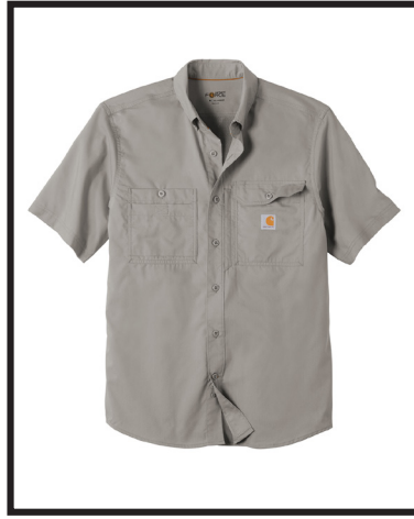
CARHARTT FORCE - CT102417