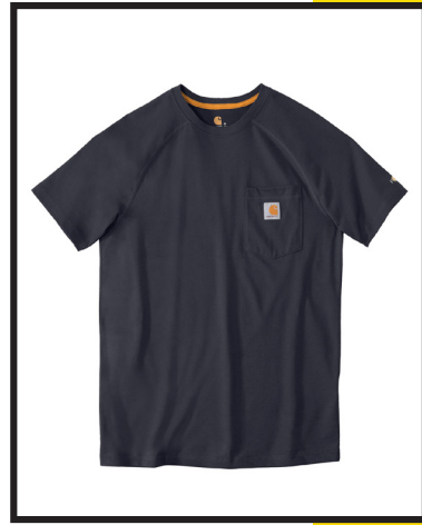
CARHARTT FORCE - CT100410