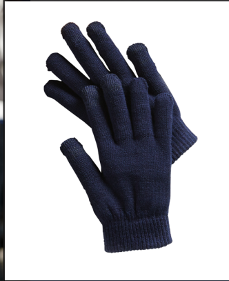
Touch Screen Gloves